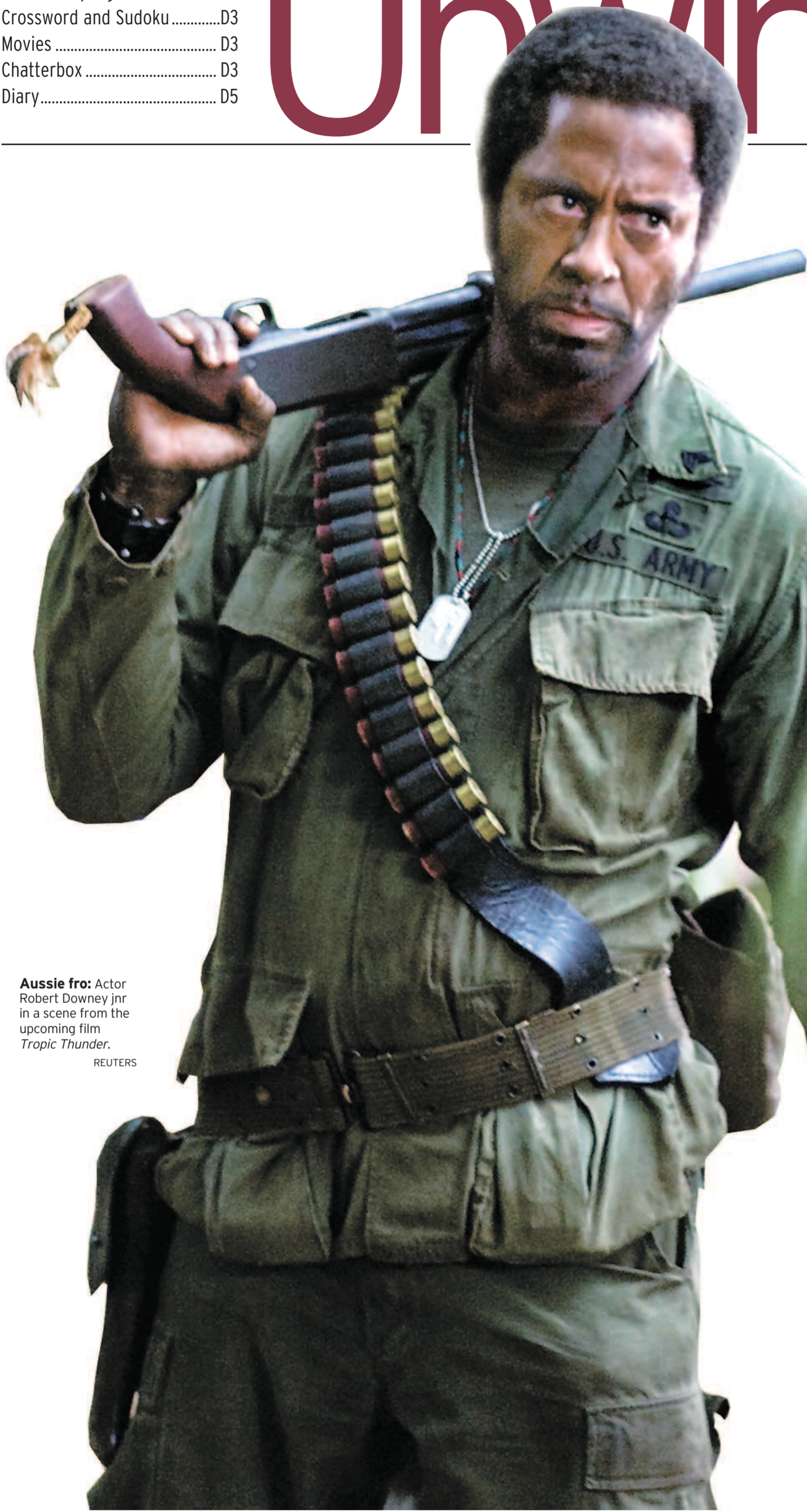
Aussie fro: Actor Robert Downey Jr in a scene from the upcoming film Tropic Thunder.