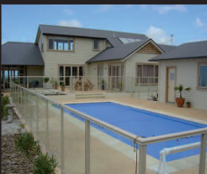
Balustrade & Pool Fencing