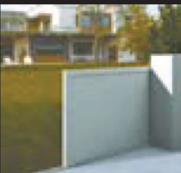
Security & Insect Products