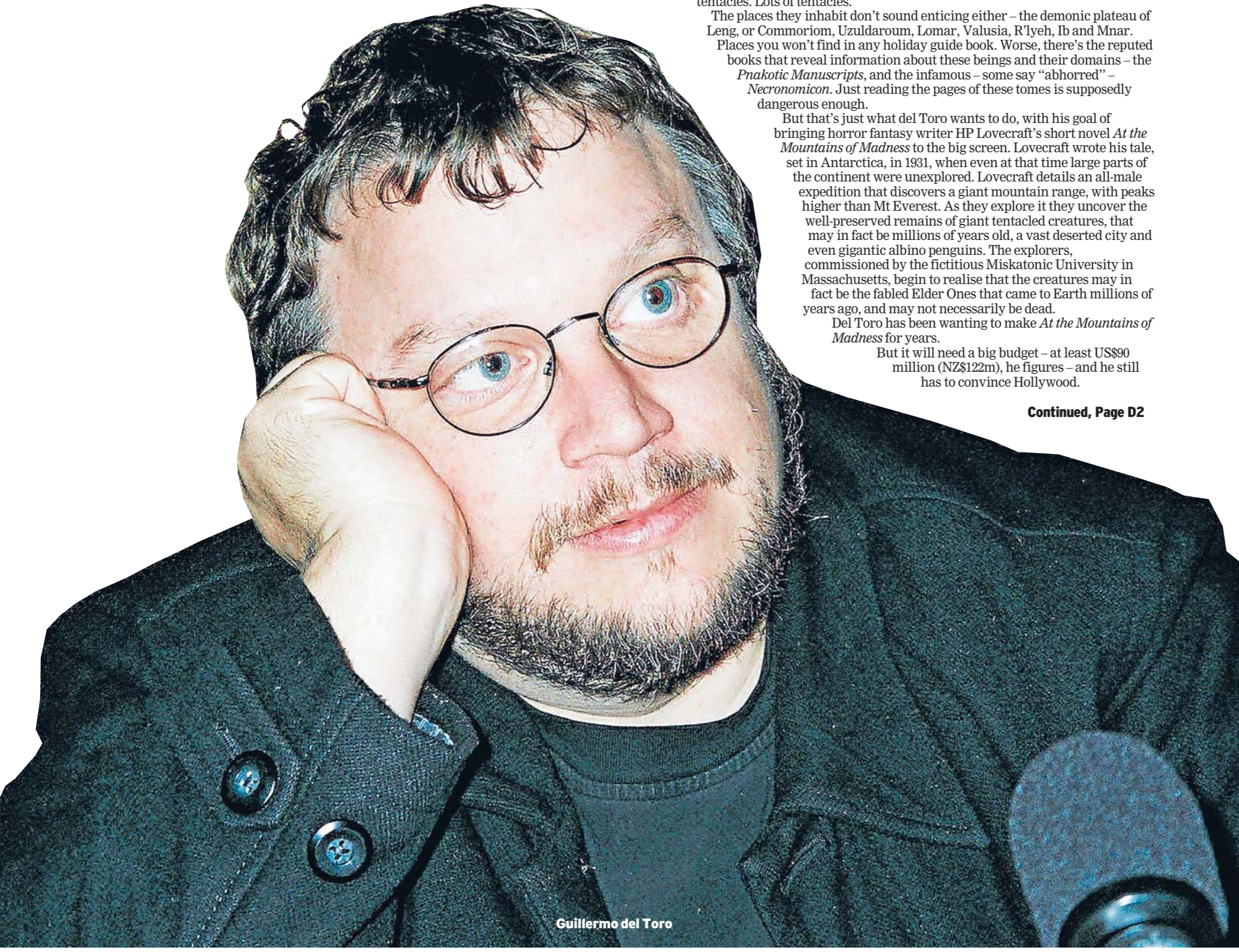
Guillermo del Toro