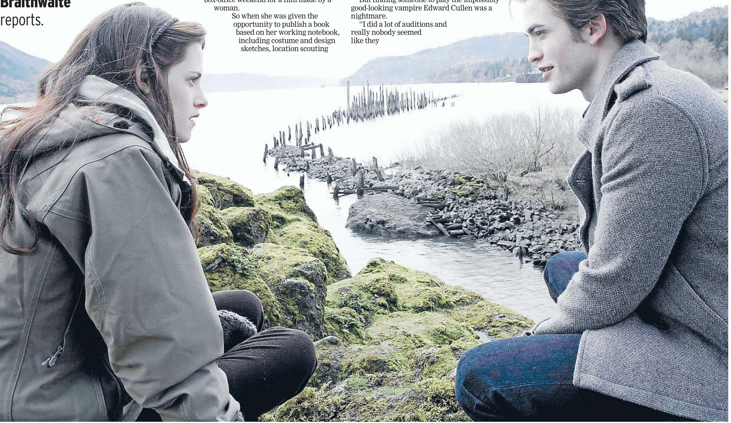
Blood and romance: Actors Kristen Stewart and Robert Pattinson in a scene from the movie Twilight .