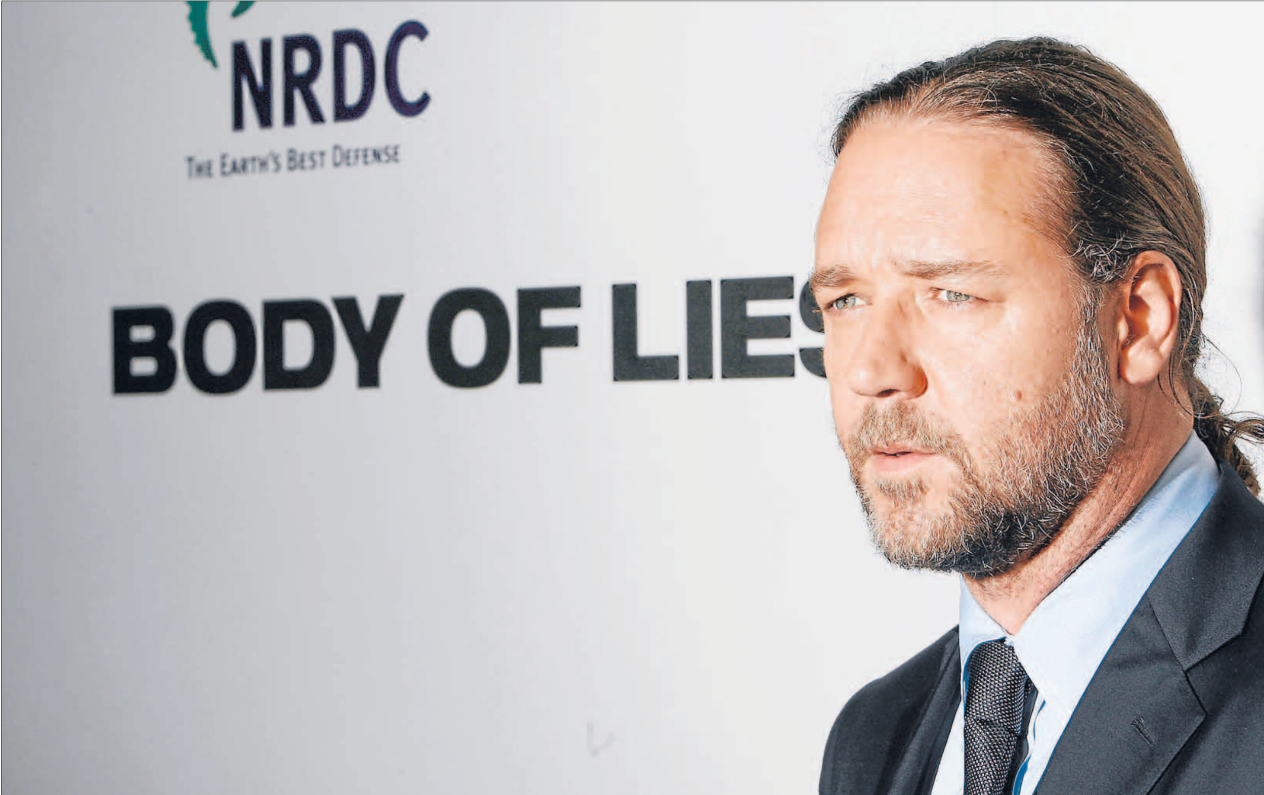
Peaceful man: Russell Crowe at the premiere of his new film, Body of Lies .